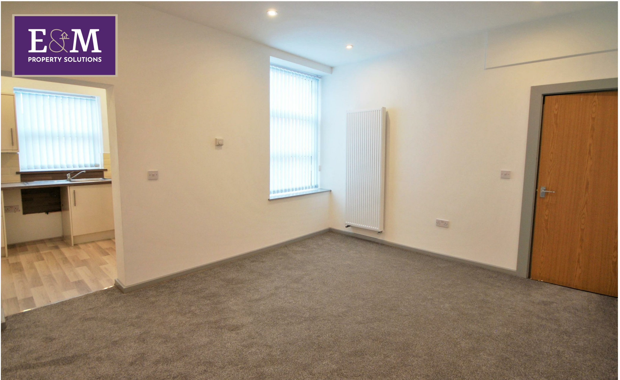
Apartment 4, Luna Apartments 23-25 Spenser Street, Padiham, Lancashire, BB12 8RD £595 Per month